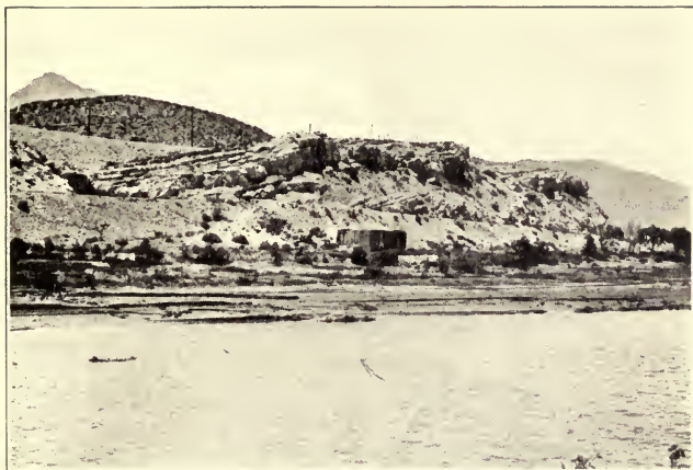
THE RIO GRANDE